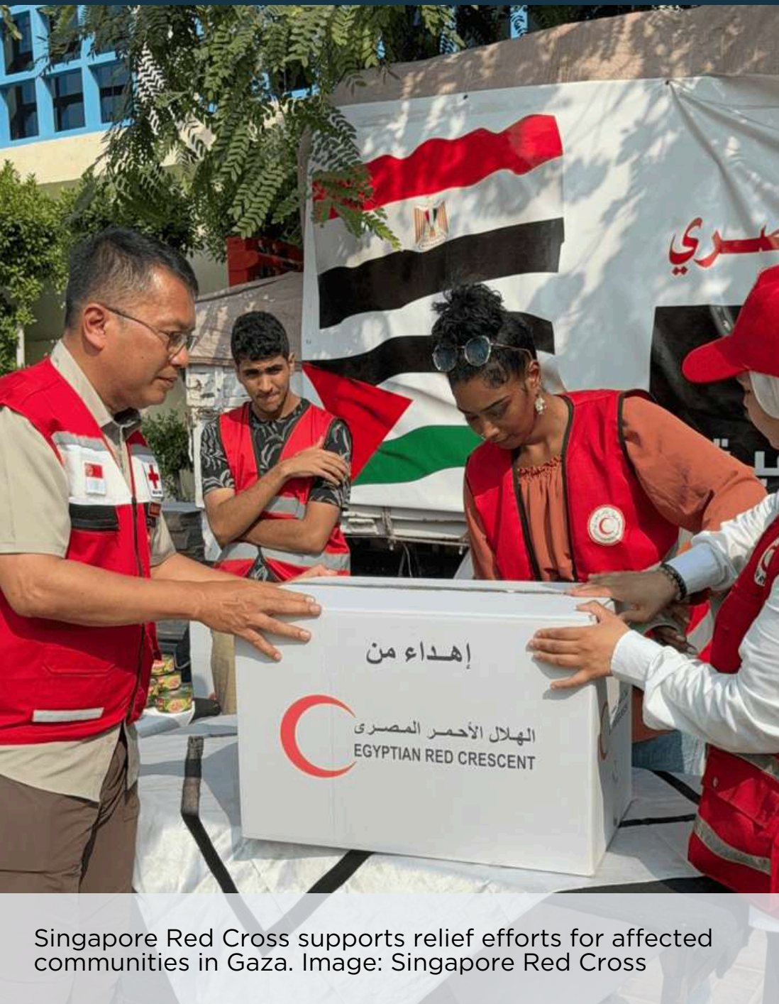
Singapore Red Cross supports relief efforts for affected communities in Gaza.

The mutual trust and respect among different races and religions in Singapore have been built over many years by generations of Singaporeans.