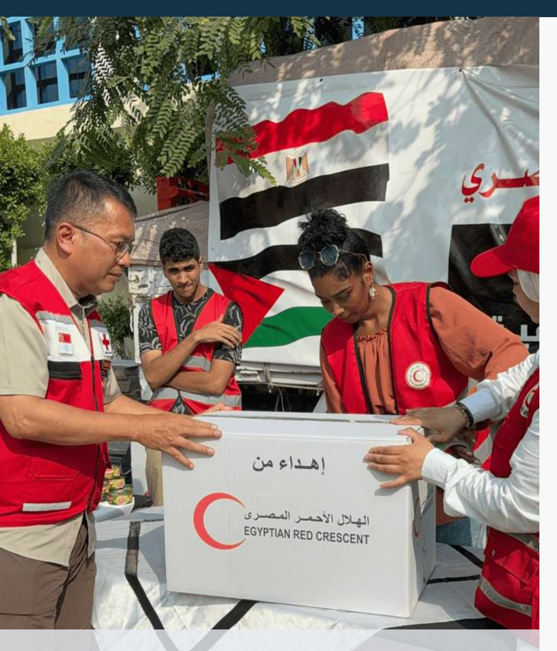
Singapore Red Cross supports relief efforts for affected communities in Gaza.

The mutual trust and respect among different races and religions in Singapore have been built over many years by generations of Singaporeans.