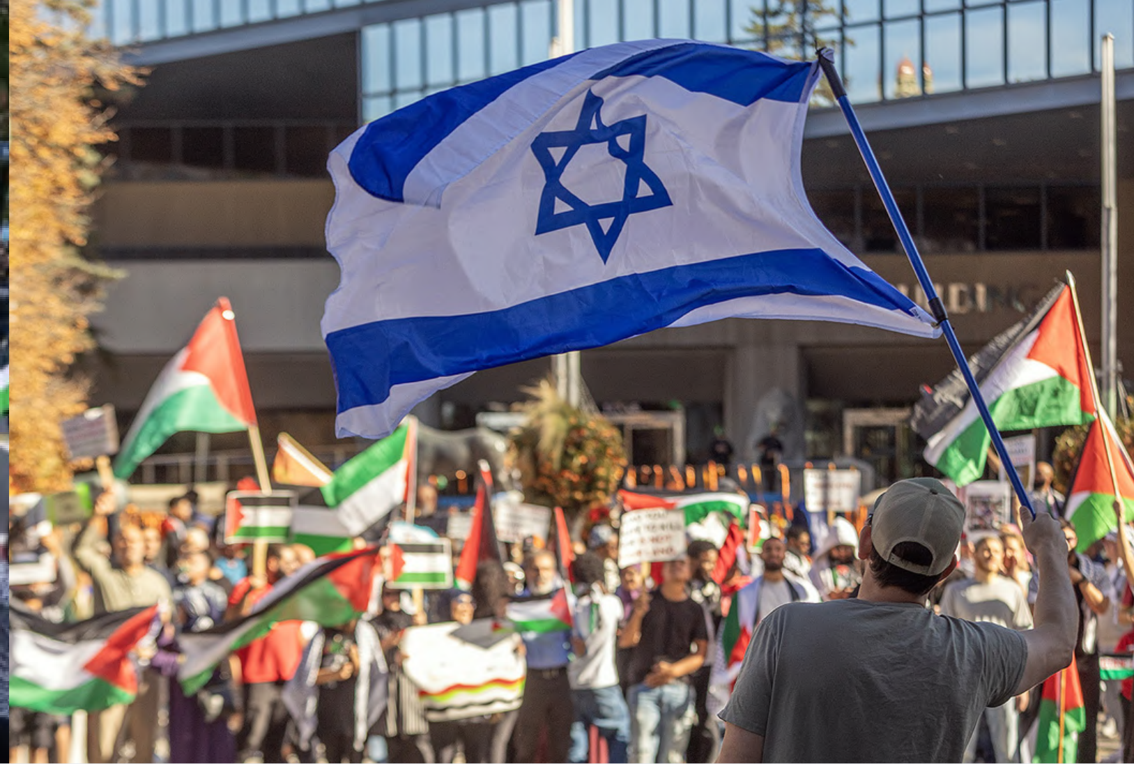
A lone pro-Israel counter-protester waves an Israeli flag against pro-Palestinian protesters at Calgary City Hall on 9 Oct, 2023.