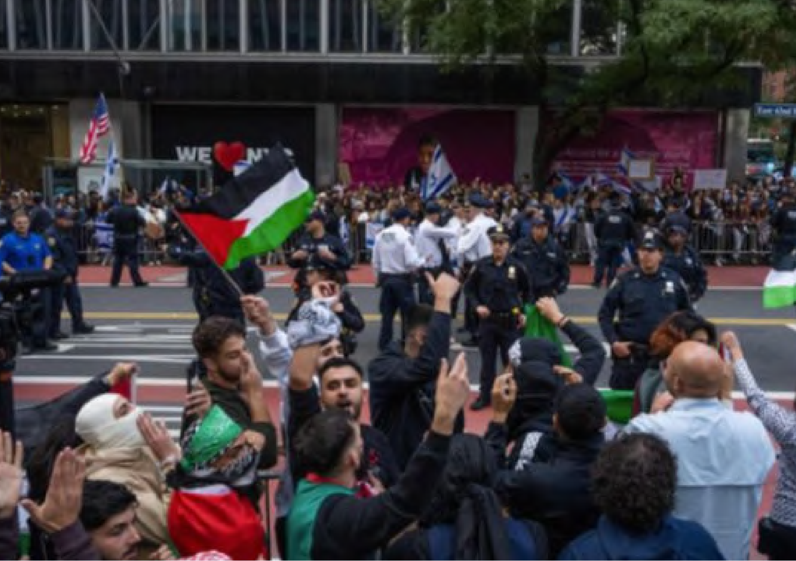
Opposing groups protesting in New York City outside the Israeli Consulate on 8 Oct, 2023.