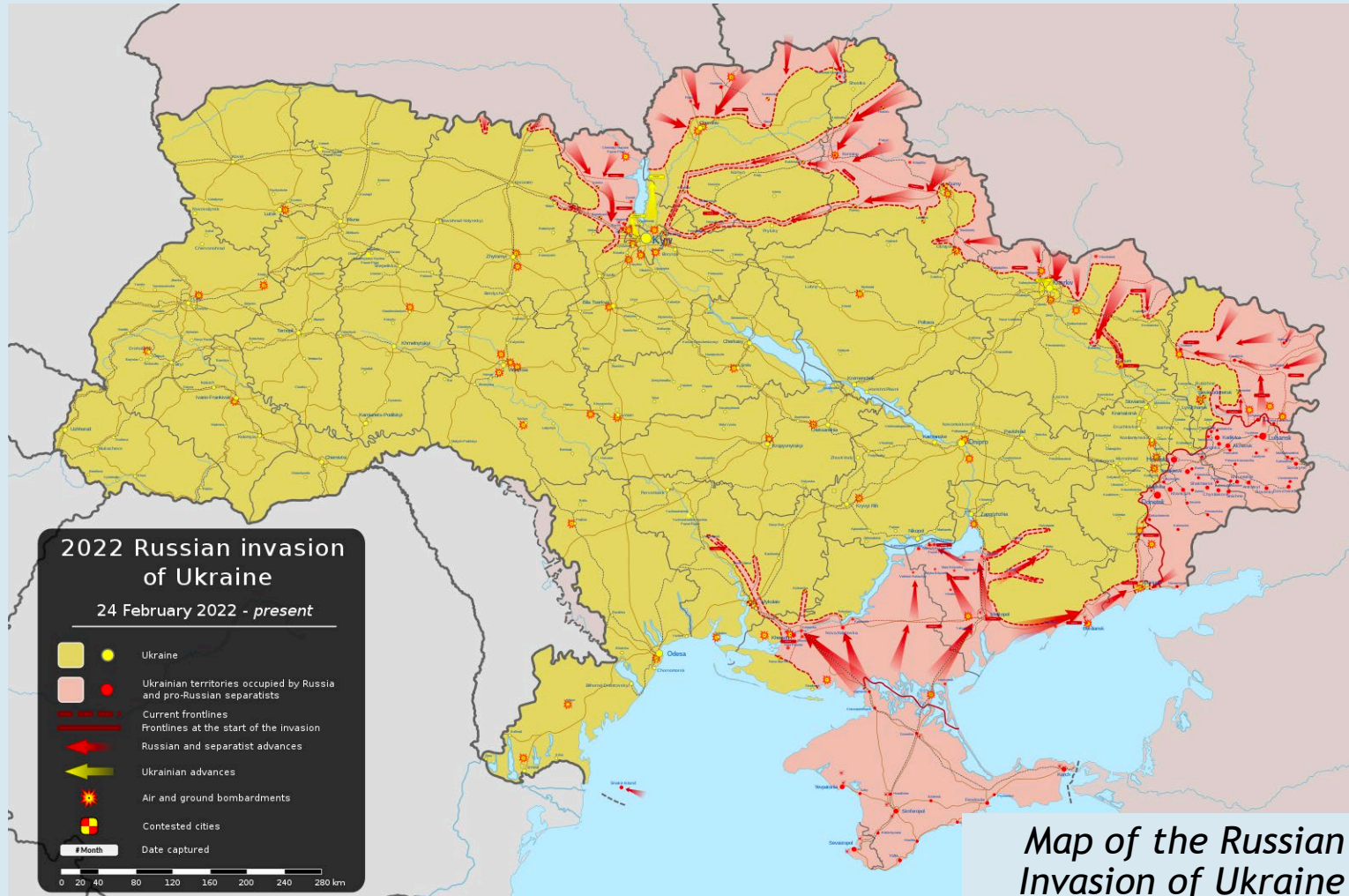
Map of the Russian Invasion of Ukraine